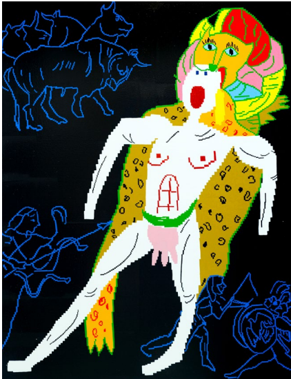
Maja Djordjevic, Tenth labour: Cattle of Geryon , Oil and enamel on canvas, 100 x 130 x 3 cm, 2018