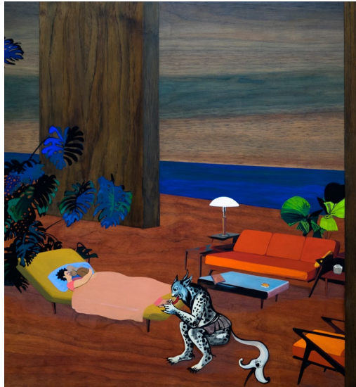
Hulda Guzman, Be kind to your demons (The nightmare) , Acrylic gouache and acrylic ink on wood veneer on cedar plywood, 68 x 68 cm, 2018