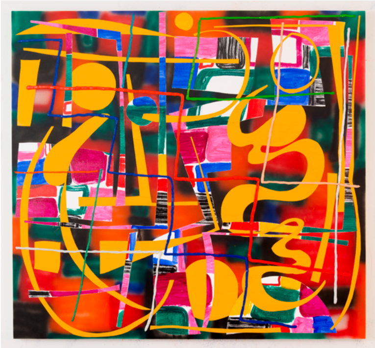
Trudy Benson, Vidimus , Acrylic and oil on canvas, 155 x 168 cm, 2018