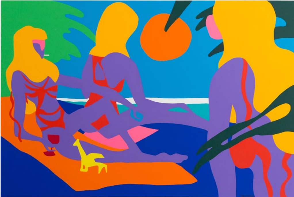
Todd James, The Gods Are Smiling on Us , Acrylic on canvas, 122 x 183 cm, 2018