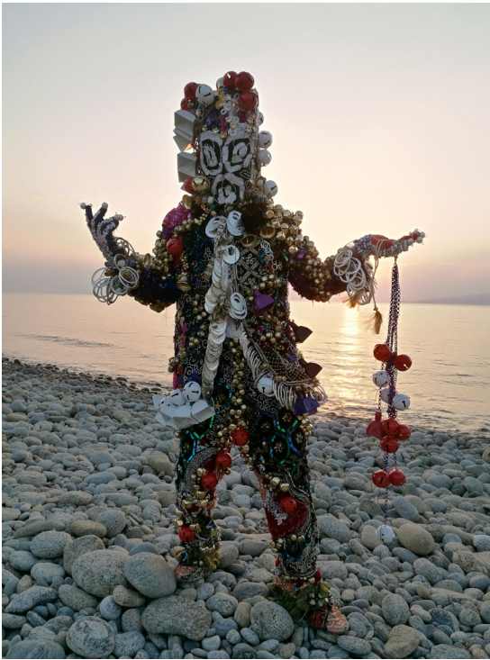
Raul de Nieves, Ceremonial Alien of Metal Exits IV , Vintage sequin appliqués, thread, glue, plastic beads, plastic dolls, ribbons, cardboard, silk, metal bells, chains, mannequin, 160 x 91 x 51 cm, 2018