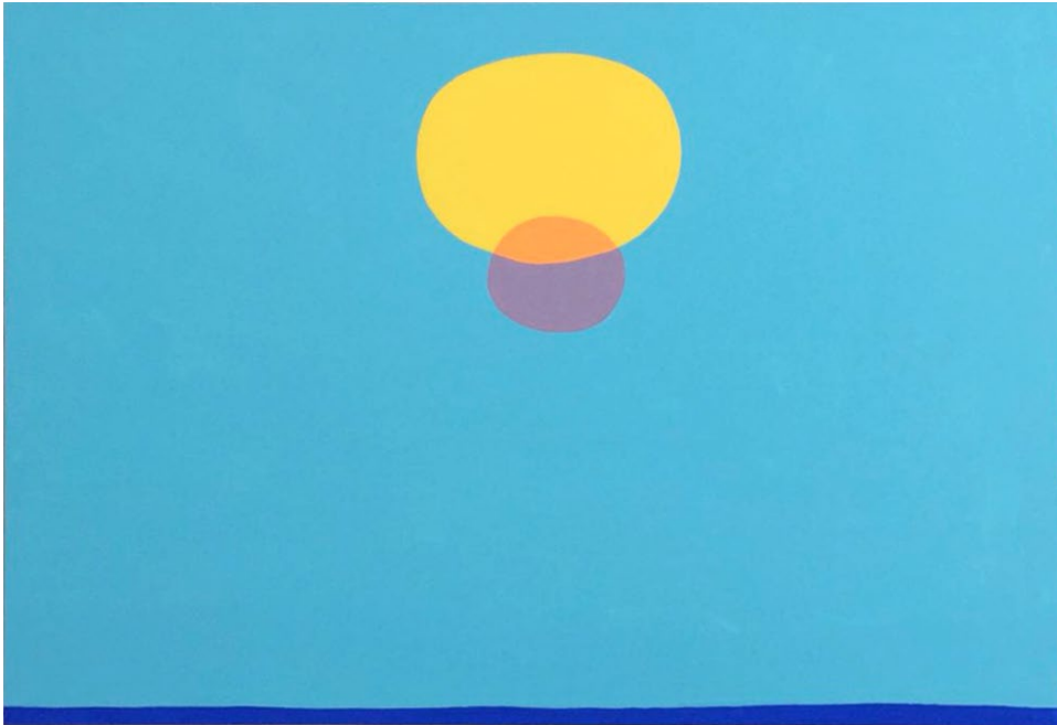
Peter McDonald, Sun , Acrylic gouache on canvas, 50 x 66.5 cm, 2018