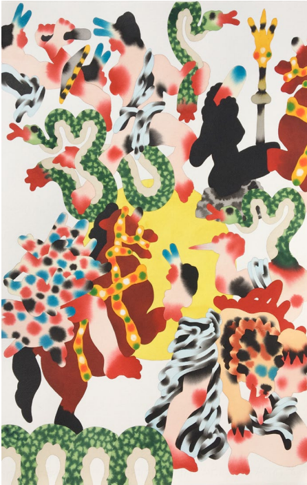
Matthew Palladino, Blood of Cronus , Watercolor and ink on paper, 56 x 76 cm, 2018