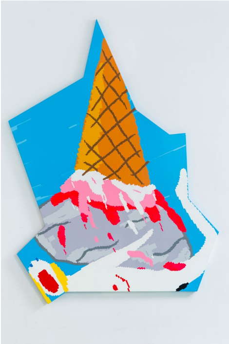
Maja Djordjevic, He hit me , Oil and enamel on wood, 164 x 120 x 3 cm, 2018