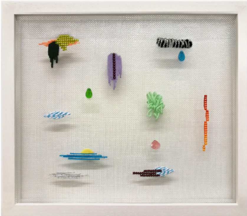
Iliodora Margellos, Facing the sun , Handmade embroidery on metal grid sheet, 39 x 33 cm, 2018