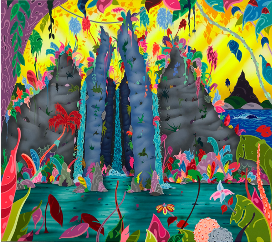
Erik Parker, Triple double falls , Acrylic on canvas, 102 x 144 cm, 2018