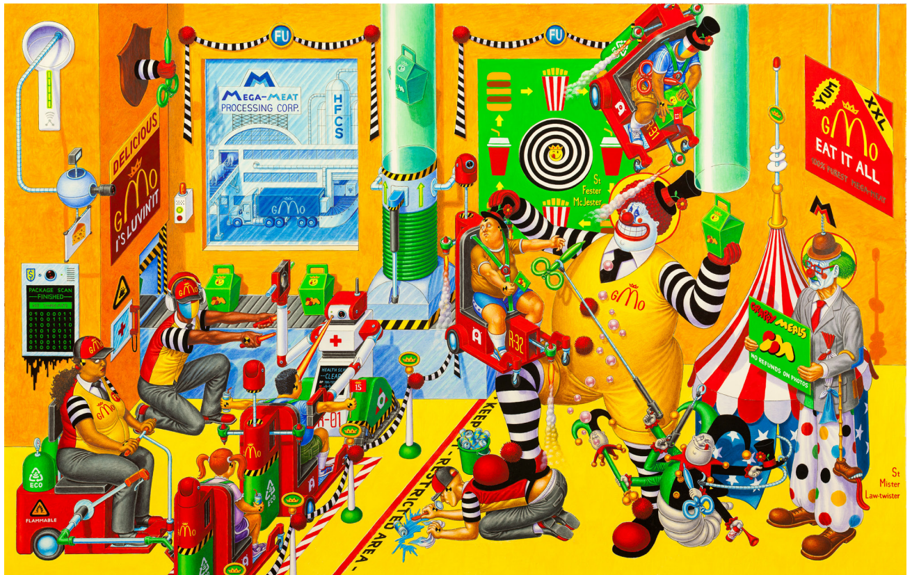
Aleksandar Todorovic, Eat It All , 2017, Watercolor and acrylic gouache on paper, 65x100cm