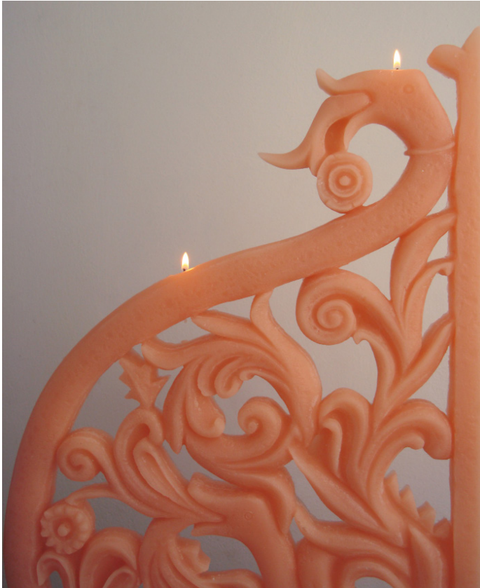
Malvina Panagiotidi, Heartburner II , Detail view