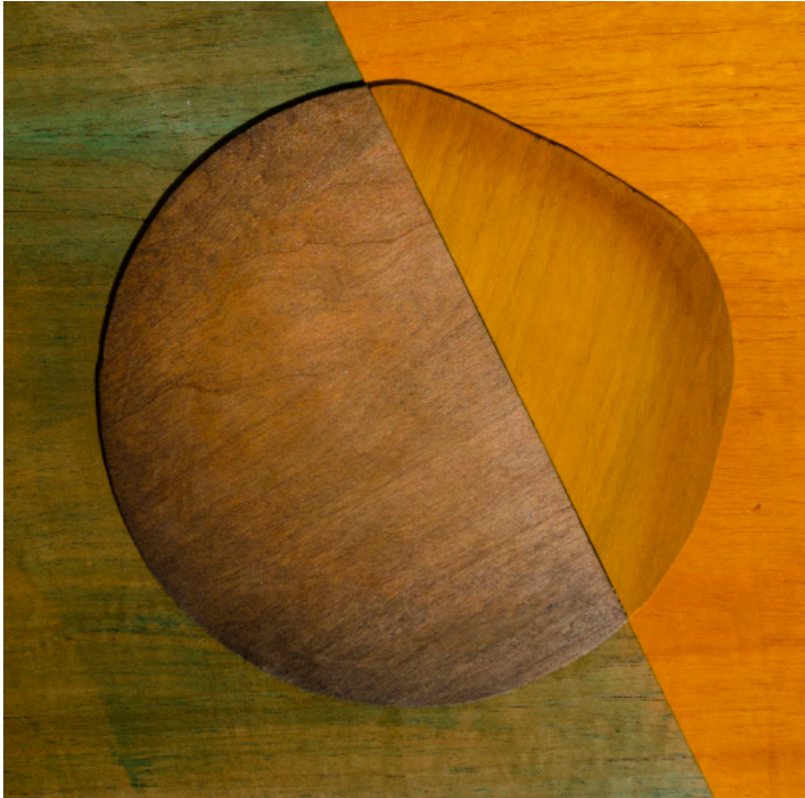
Hulda Guzman, Ita , Detail view