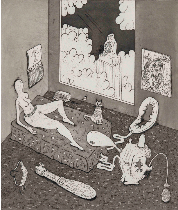
Zachary Leener, Five Etchings (Penthouse) , 2015