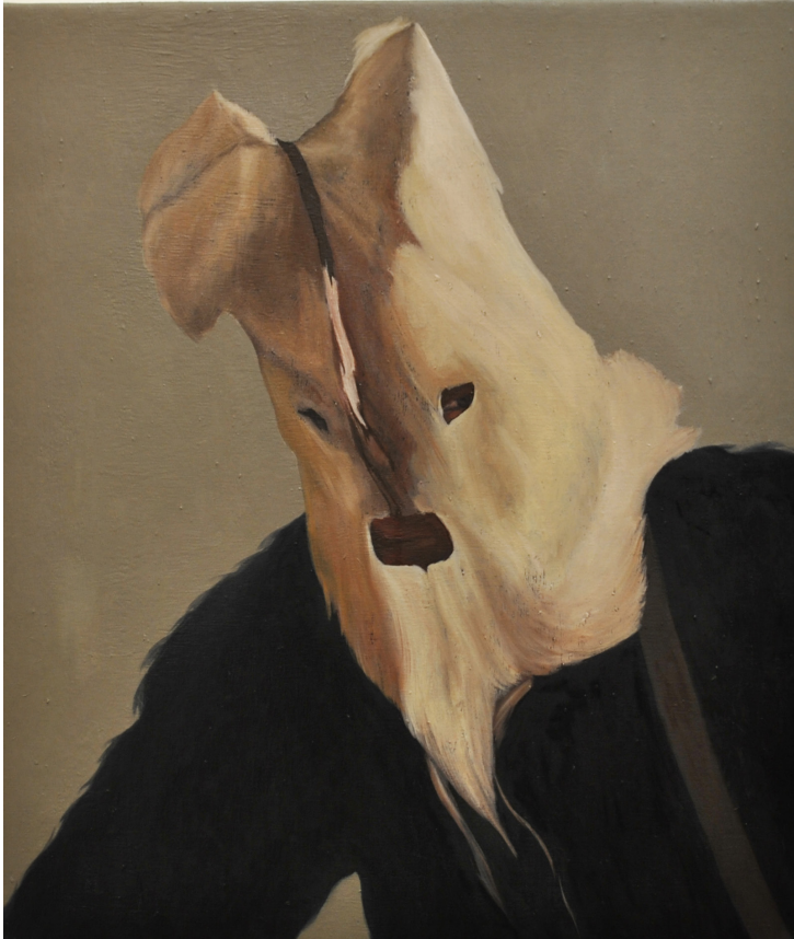
Koudounas , oil on canvas, 40 x 50 cm, 2016