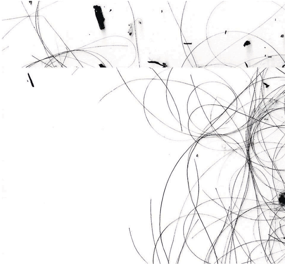
Maria Efstathiou, detail of Hair I , black and white giclée print, 124 x 32 cm, 2016