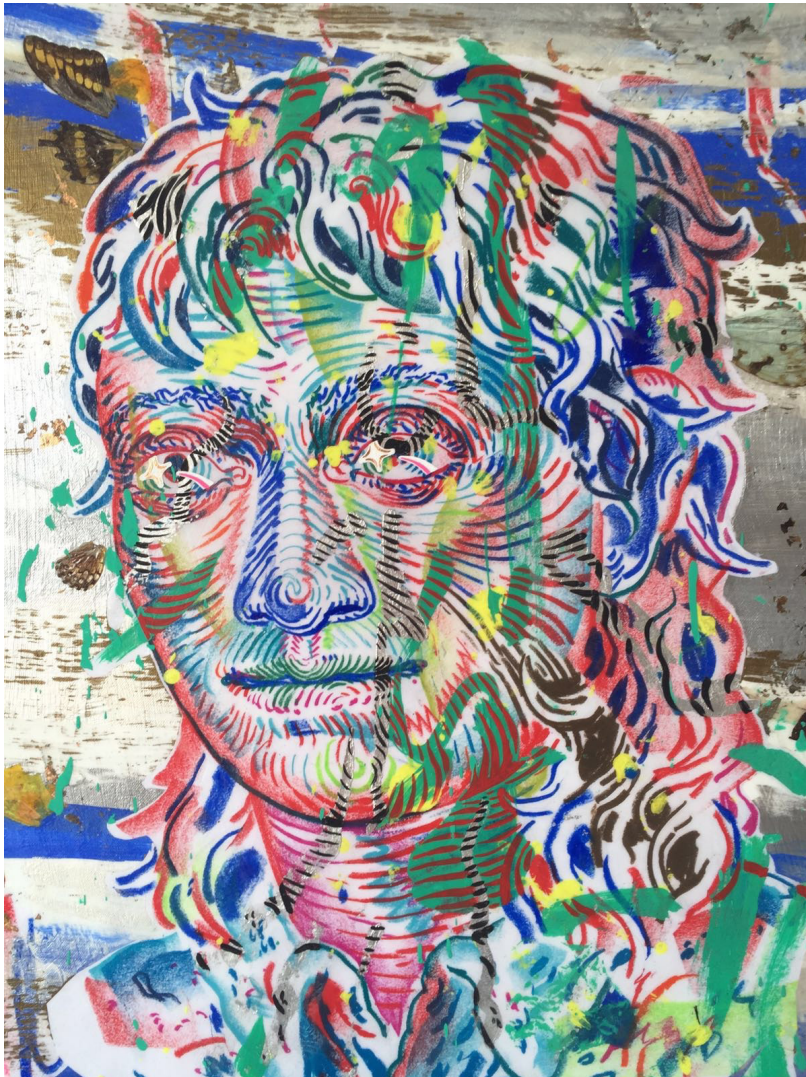
Bronzed , Acrylic, flashe, wax crayon, paper and butterflies on canvas, 70 x 50 cm, 2016