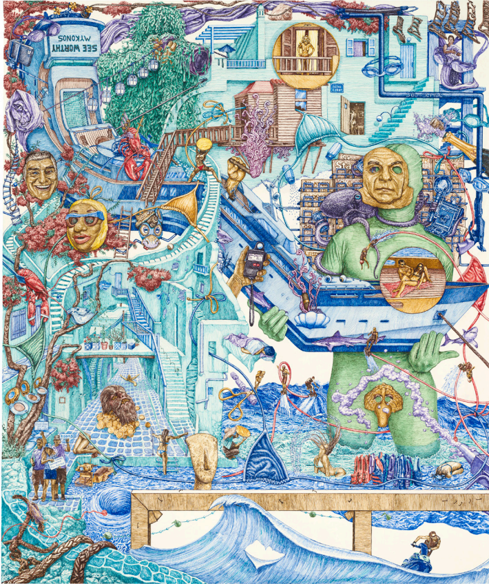
Seeworthy , ink on archival paper, 119 x 99 cm, 2016