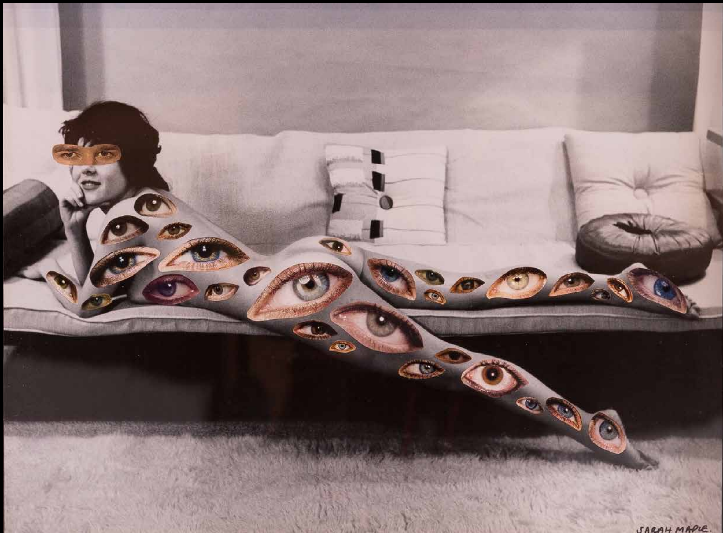
A detail from The Most Heightened State of Being Female No 5 by Sarah Maple.

The cheek of it: artists celebrate the bottom – in pictures