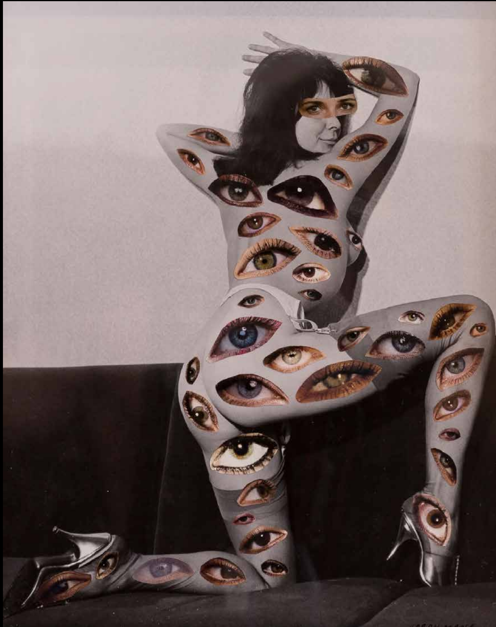
The Most Heightened State of Being Female No 6 by Sarah Maple