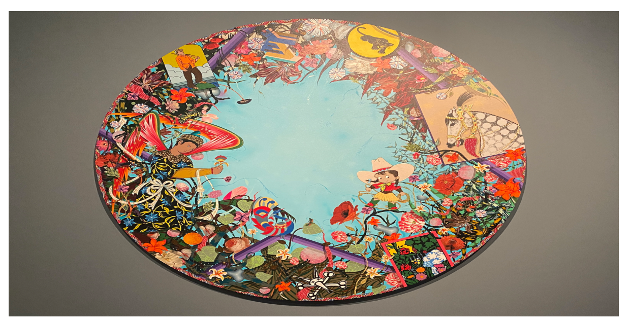
Amir H. Fallah, "Cowgirl" (2020), acrylic, spray paint, and collage on canvas

<u>The Fallacy of Borders</u>, on view at the UCLA Fowler Museum through May 14, is the first solo exhibition of the artist, whose bold, bright paintings, sculptures, and stained glass pieces communicate a rich array of cultures, perspectives, and influences, all formed by the many diasporas that shape Los Angeles, alongside his own cultural heritage as Iranian American.