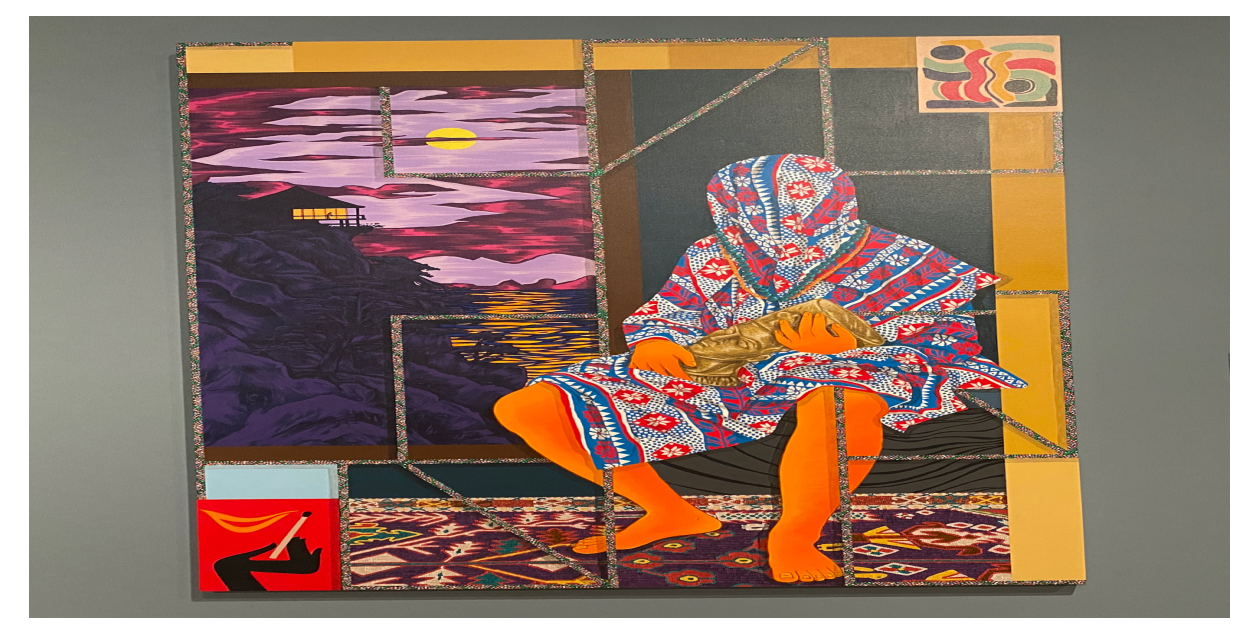
Amir H. Fallah, "Protector 1" (2022), acrylic on canvas