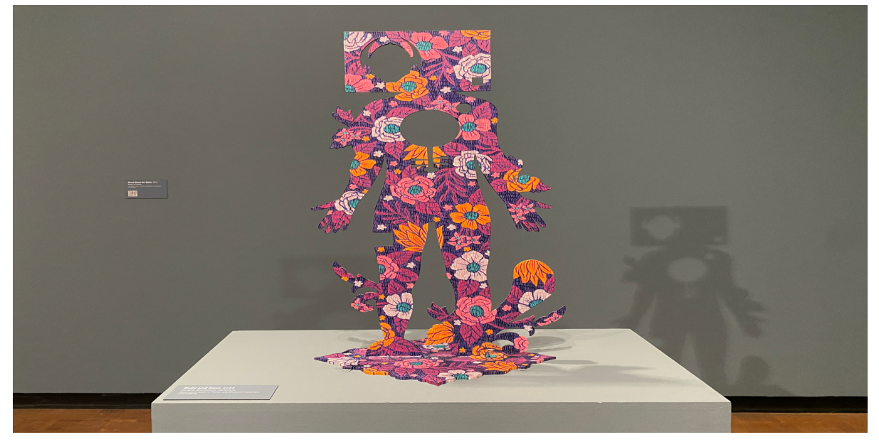
Amir H. Fallah, "Body and Soul" (2022), acrylic, aluminum, hardware

In "Protector 1," a cloaked figure holds what looks like an Egyptian bust, and in the distance a Japanese woodblock-style print features another figure gazing out from a cliffside onto water. According to the exhibition text, the painting is about the downsides of cultural preservation, which so often entails taking cultural heritage from one country in order to showcase it in another. But in the context of this show and its themes I tend to see it another way: as an immigrant holding onto whatever piece of the past they can, knowing it, too, could one day be taken away.