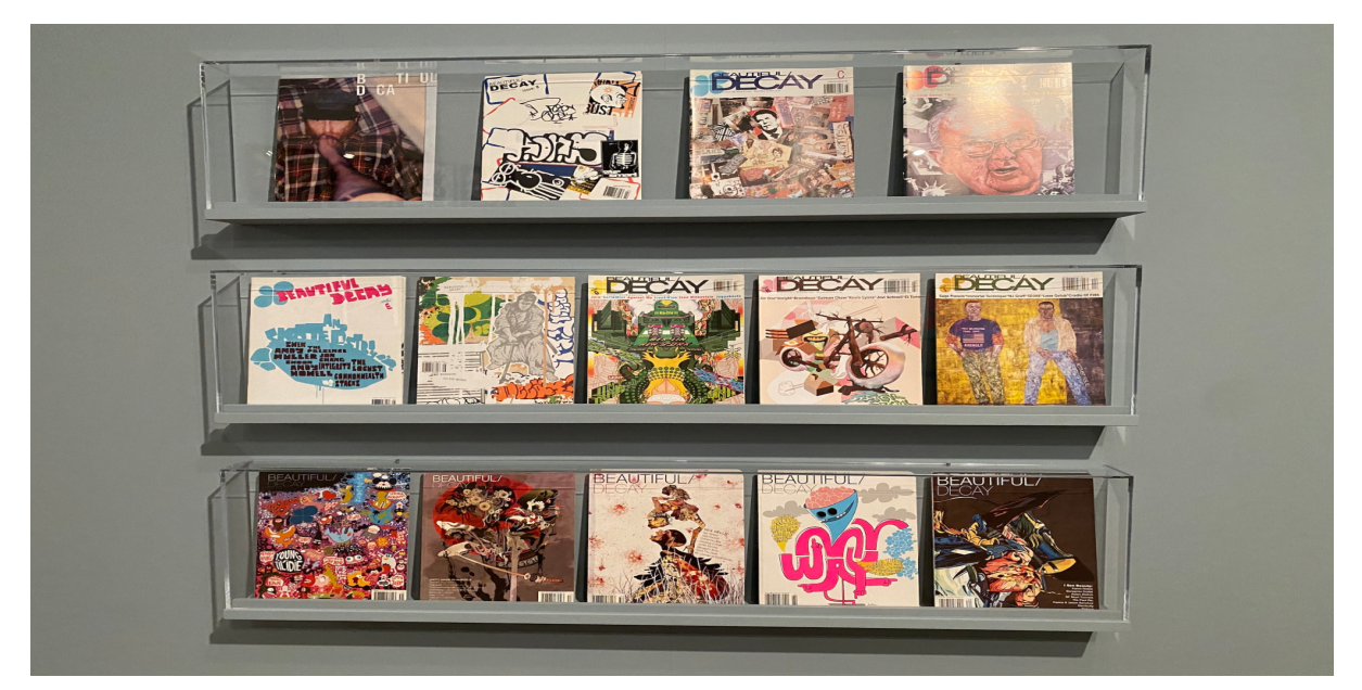
Covers of Beautiful/Decay